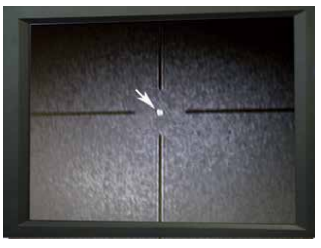
Figure 2. Both the test and reference beams should pass through the crosshairs on the Alignment Monitor.

1. Mount and position the transmission flat (t-flat). A spot should appear on the FizCam's Alignment Monitor. Adjust its tip and tilt such that the beam passes through the center of the crosshairs on the Monitor.