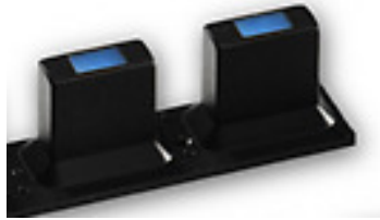
One layer for light control