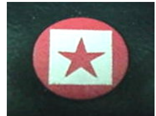
Three layers for night design