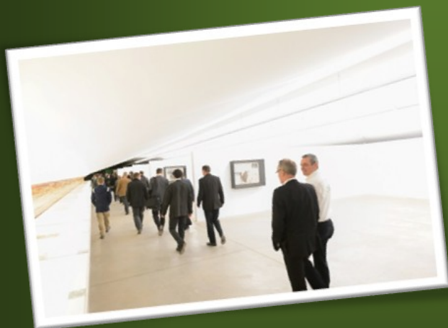
Last at the Verbeke Foundation in Kemzeke Belgium