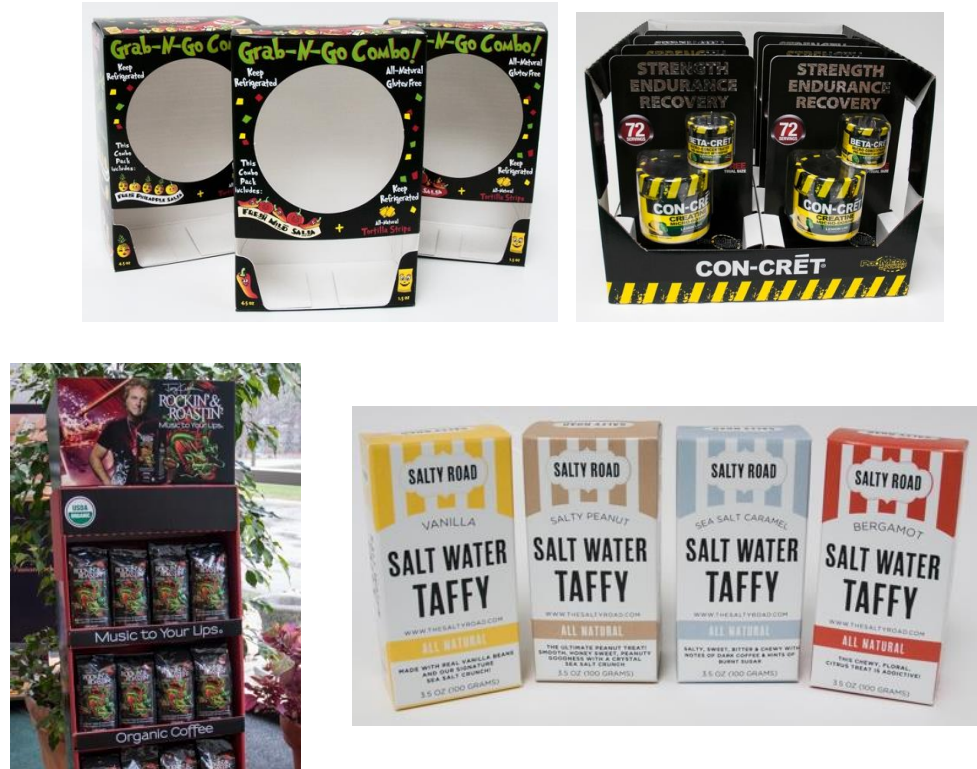
Figure 2: Example Offerings from Accutech

Accutech utilizes its digital printing capabilities to offer: