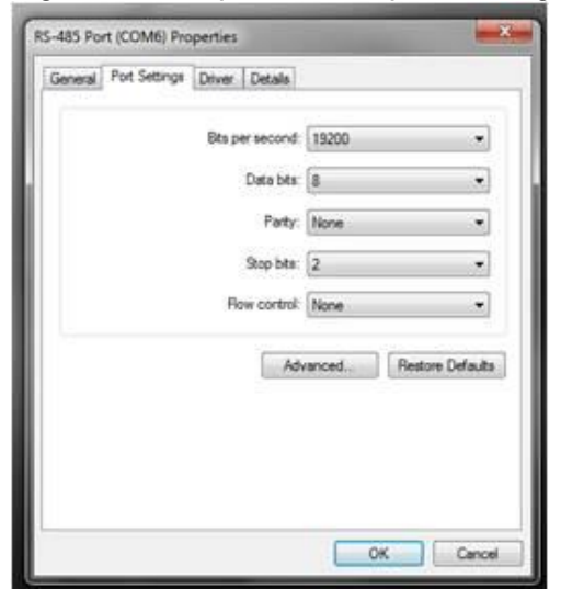
Figure 2: Computer COM port settings