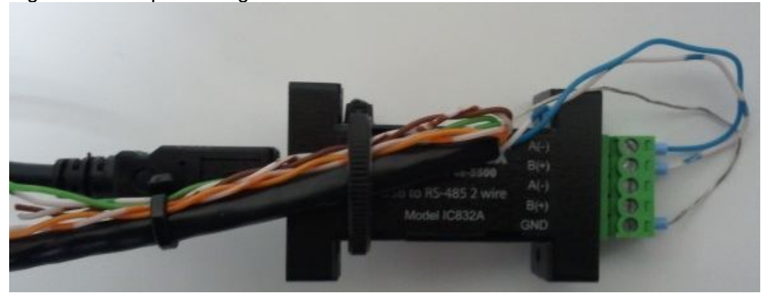
Figure 1A: Adapter wiring

At this point plug one end of your straight Ethernet cable into the inverter's RJ-45 port on the front of the drive (Figure 1B).