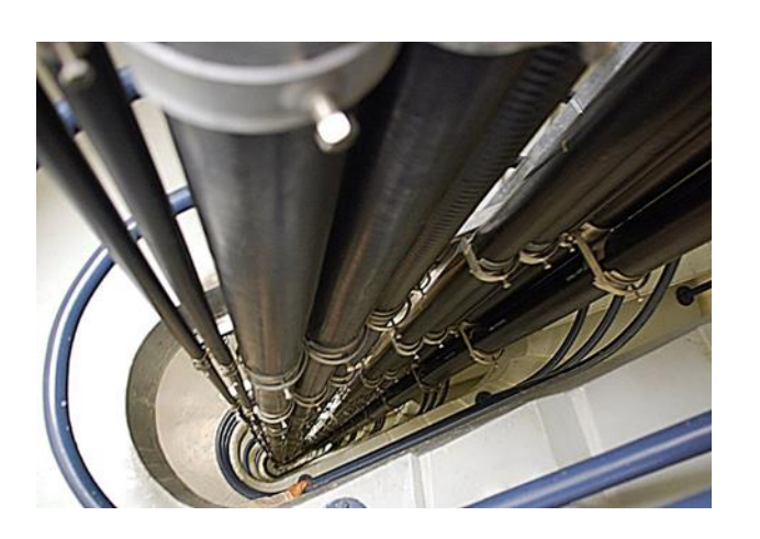
6. Rigid cable installed in a broadcast tower

Connections to the transmitter and antenna are made using RF connectors that accommodate the specific diameter of the transmission line, and rigid transmission line can be made to suit both 50-and 75-ohm impedances. It's most commonly used indoors but can be weatherized as well, as one of its most common uses is in the broadcast industry.