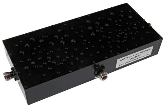
Anatech Electronics duplexers are fundamental elements in many point-to-point microwave systems.

In addition, quantization noise is created when the interfering signal level is high enough to require gain compression to prevent clipping. The resulting reduced dynamic range increases quantization noise, desensitizing the receiver front end.