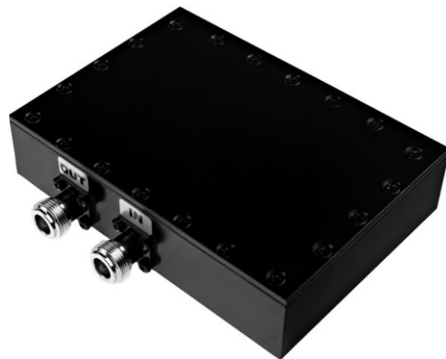
Anatech Electronics bandpass filters for backhaul systems are weatherized for outdoor mounting.

As is the case with all co-located wireless communication systems, there are two basic ways to solve these problems.