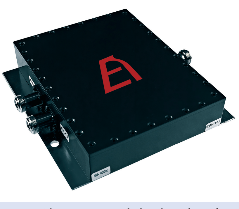
Figure 3: The 700-MHz cavity duplexer line is designed specifically to meet the requirements of LTE networks

PIM has always been lurking in the performance metrics of every base station, but with today's dense channel spacing and digital modulation techniques it is essential to reduce it to levels that will not interfere with the receive band of the host system - or in other systems collocated at a site. Recognizing this requirement, many of Anatech's cavity filters, combiners, and duplexers have been designed using metals that do not generate PIM, connectors that have proven low-PIM performance, and other techniques that reduce PIM to levels of -150 dBc or more. Requests for these models, which are available as custom parts, can be quickly accommodated along with measured PIM performance plots. In addition to filters, combiners, and duplexers, the