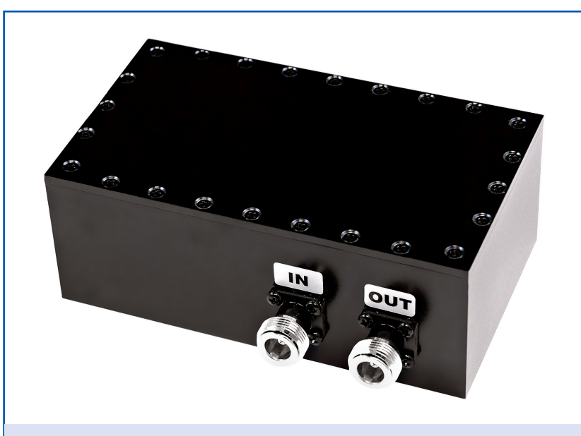
Figure 1: The Model AB734B944 cavity bandpass filter has a center frequency of 733 MHz, a 12-MHz bandwidth of 728 to 740 MHz, rejection of at least 40 dB at 700 kHz from the passband edges, and PIM of -150 dBc.

Last but not least is the problem of passive intermodulation (PIM) distortion, typically caused by passive components that because of their materials, poor connections, and general abuse generate signals can degrade receiver performance. To address the chal-