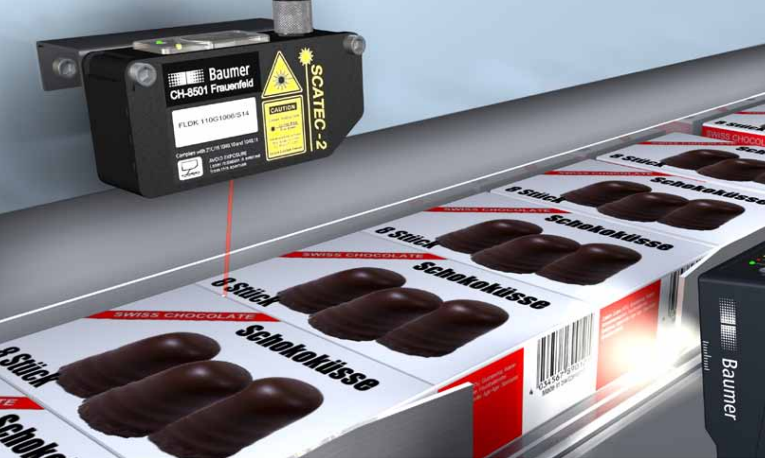
Individual package detection with seamless product conveyance.