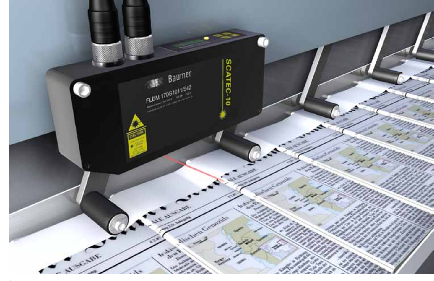
Lap stream copy counting.