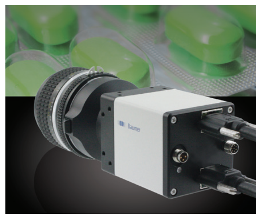
Dual GigE camera of the Baumer SX series

Innovative cameras that utilize channel bundling have connections for two Ethernet cables. As soon as the GigE connection is established on both camera ports, both channels are automatically bundled if the network adapter is properly configured. Up to 240 MB/s are then available to the camera as the bandwidth for image data. The combined channels are represented using one MAC address and are assigned one common IP address. In this way, they are registered by the software as one image-generating network component. For applications having only one individual camera, dual-port boards that fit directly in a PC slot can be used.