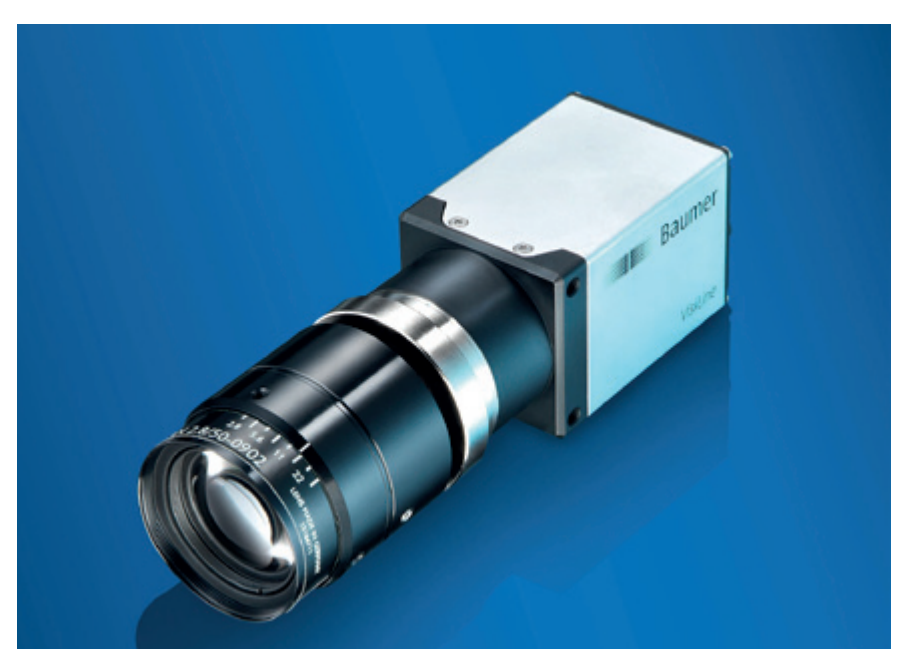
VisiLine*, a new GigE camera series introduced at the VISION, set standards in industrial image processing. The cameras, announced for the fourth quarter of 2012, combine numerous innovations that provide perfect image quality, easy integration and long-term reliability.

Machine and equipment manufacturers are put under ever-growing pressure by shorter development times and maximum cost optimization. Individual components such as cameras or all-in-one systems like vision sensors should therefore be implementable with as much flexibility and savings in time and cost as possible, so more time is avail-