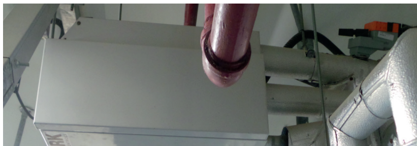
The Fan Coil Units equipped with the Belimo Pressure-Independent Characterised Control Valves (EPIV).