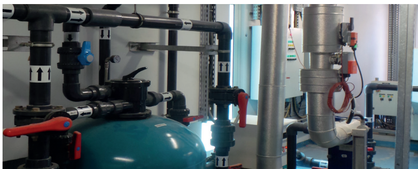
The Heat Exchangers equipped with the Belimo Energy Valves™.