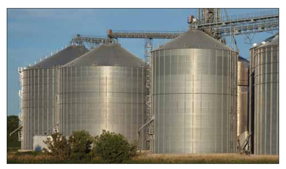
The accuracy of your inventory is determined by factors such as the bulk density of material, sensor placement, and the correctness of your bin dimensions.

Volume is very different than level. Volume is the amount of three-dimensional space the material takes up. When using the distance measured from the sensor to the material surface to estimate volume, the calculation is based on the internal vessel dimensions and the distance to that one point on the material surface. Therefore, it's essential to have accurate vessel dimensions as mistakes in geometry will increase the overall error in the volume calculation. Material flow, buildup, or bridging can affect volume calculations. The placement of the sensor and the location of the filling and discharge points also have an impact on the overall accuracy of volume.