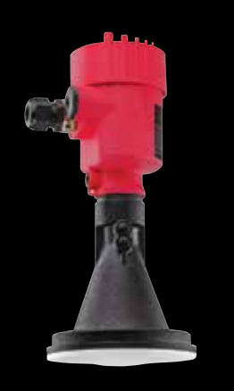
Lightweight Plastic Antenna Option