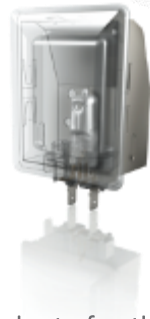
Products for the domestic appliance industry