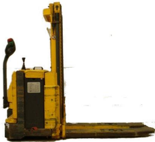
Electric pallet truck