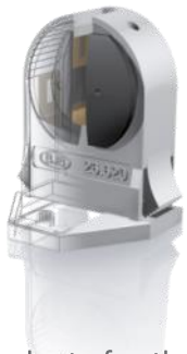
Products for the lighting industry