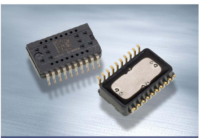
Combined inertial sensor SMI500 for VDC