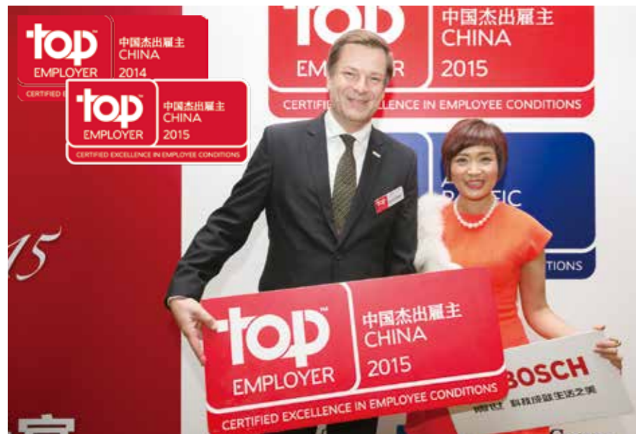
Bosch is named China's top employer 2015 by the independent international human resource institute Corporate Research Foundation (CRF) for the fourth year in a row. 博世连续第四次荣获CRF联合调查机构授予的2015年“中国杰出雇主”称号。