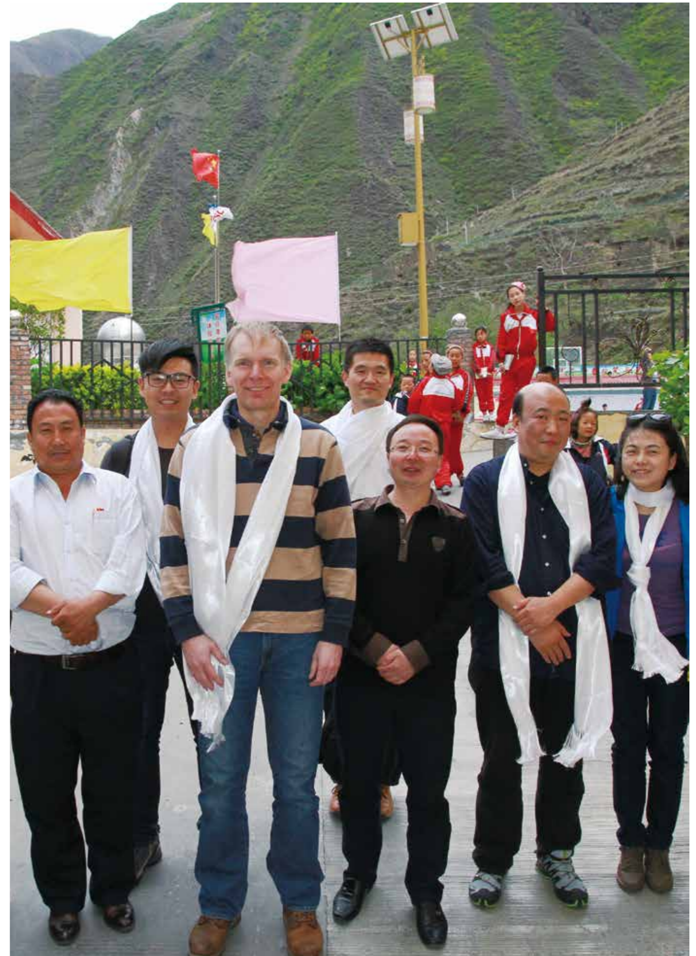
Bosch volunteers visit Heishui Bosch School in April 2014. 2014年4月，博世志愿者前往位于黑水木苏的博世博爱小学。

In Shanghai, associates from headquarters actively participated in a series of "Bosch Volunteer Carnival" activities. In the "Read a dream for love" activity, the New Year Wish cards written by students at Bosch Baichuan Caring School were given out to associates within several minutes. In Wuxi, volunteers took part in a mountain-climbing and environmental protection activity, in which they not only helped clean up Xihui Park, but also promoted the idea of environmental protection concept among the local communities. In Hangzhou, volunteers supported students from Songcun Primary School by taking them on a trip to Hangzhou city to experience their urban peers' school lives. It is hoped that this will expand their horizons and strengthen their confidence. Since the "one-to-one bursary" was launched in Suzhou in 2010, a total of 218 students from Heishui Bosch Primary School have received financial support. In addition to that, a volunteer team led by members of management has paid visits to these poor families almost every year. In the summer of 2014, 28 volunteers went to Heishui Bosch Primary School and held a "1+1+1" summer camp in order to learn about the pupils' economic status and actual needs.