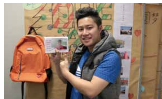
A Bosch volunteer claims a wish card written by a child at Bosch Baichuan Caring School. 博世志愿者认领来自甘肃白川博爱小学学生的新年心愿卡。

在慈善项目顺利实施的同时，博世中国志愿者活动在企业所在地社区有声有色地开展着。在扶贫助困、倡议环保、助学敬老等领域，各地员工志愿者积极投入公益事业，以身体力行的方式践行博世“取之社会、回馈社会”的价值观和慈善理念。据最新统计，博世在华志愿者在册人数已超过1700人。