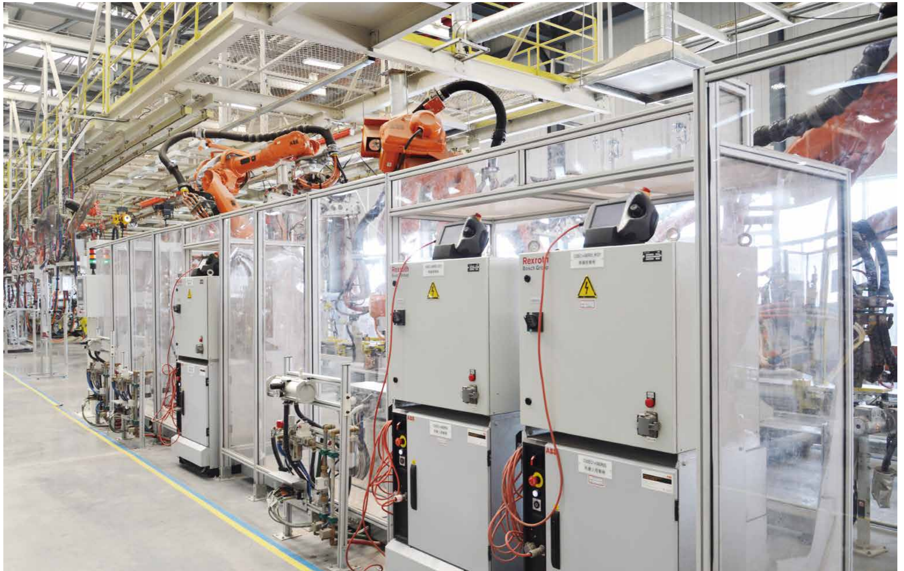
Bosch Rexroth's Advanced medium - frequency welding system can make perfect automotive body. 博世力士乐最先进的中频焊接系统成就完美汽车车身。