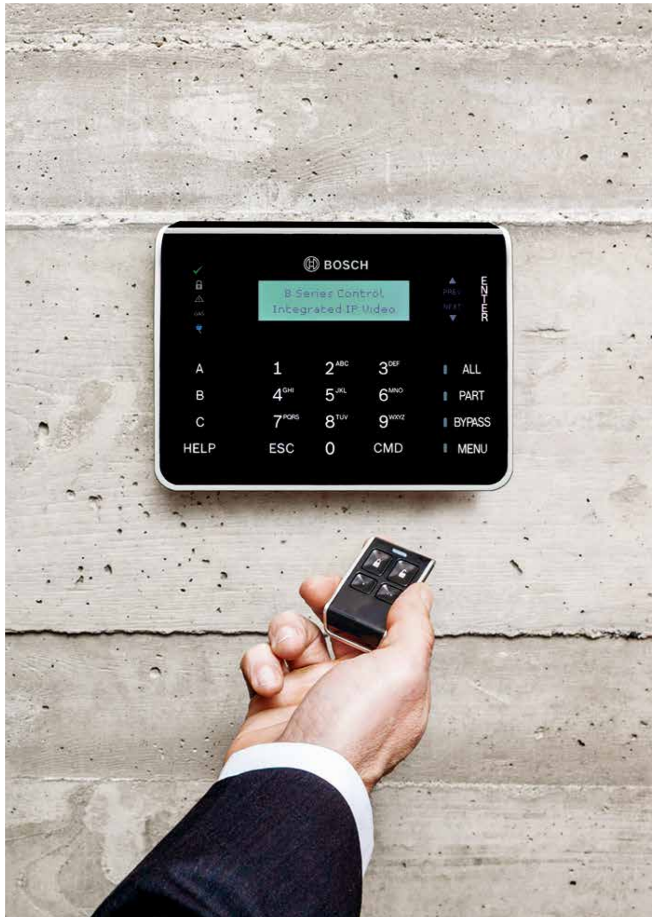
Bosch B Series Intrusion Control Panels provide security guarantees for families and offices. 博世B系列防盗报警系统，为居家及办公安全提供最大保障。

Bosch gas water heater with thermostatic function make your bath more comfortable. 博世燃气热水器保持水温恒定，为淋浴带来舒适体验。