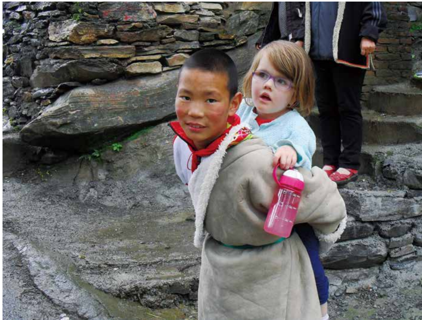
In July 2014, Bosch China volunteers help organize a summer camp in Heishui. 2014年7月，博世志愿者共同举办了第一届黑水夏令营。