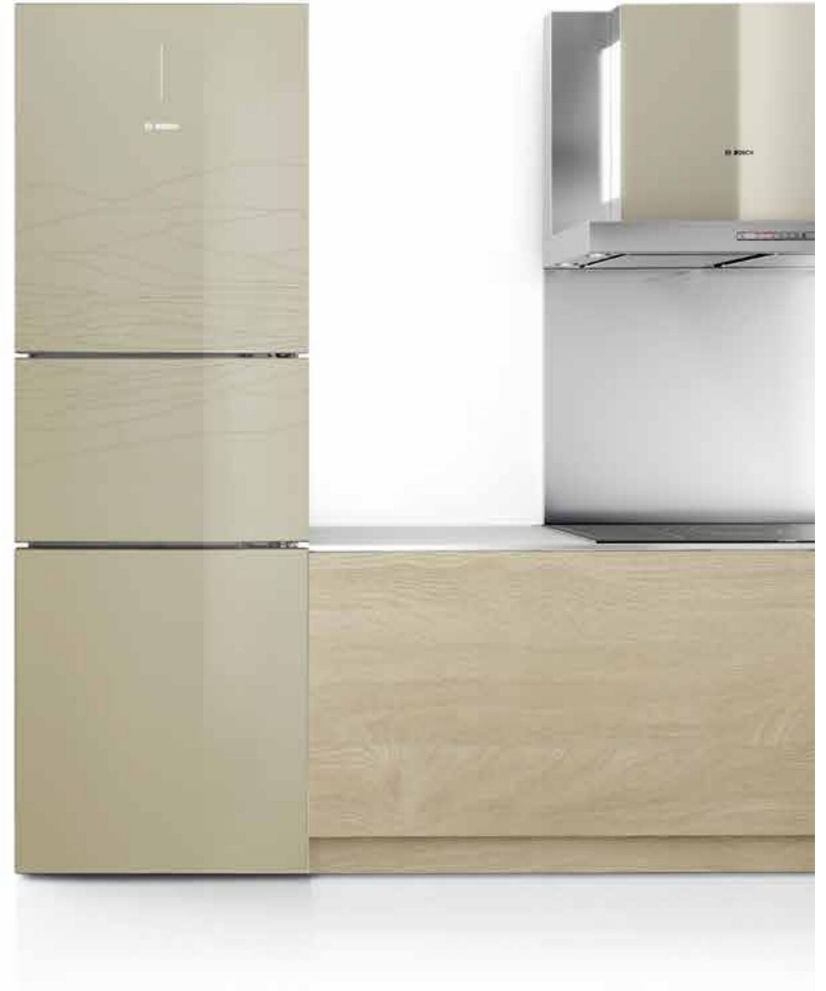
BOSCH Quartz kitchen appliances | 博世金沙系列厨电套装