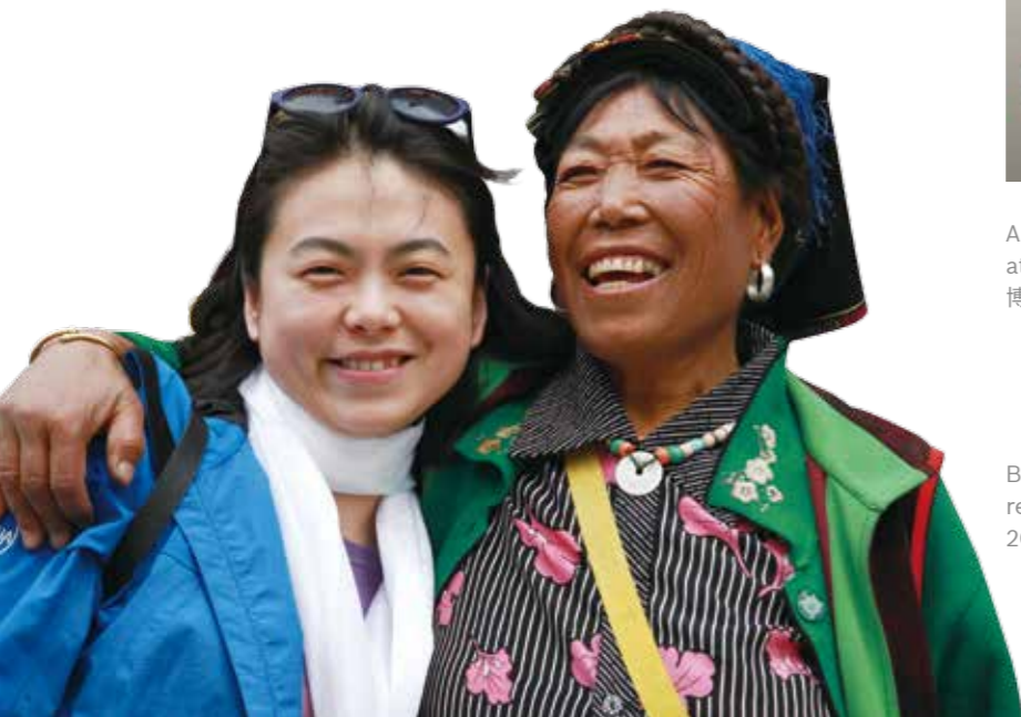
Bosch volunteers take group photos with local residents in Heishui in April 2014. 2014年4月，博世志愿者与黑水木苏当地居民合影留念。