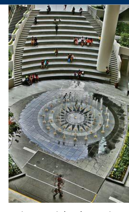
Robert Bosch (SEA) Pte Ltd Security Systems 11 Bishan Street 21 (S) 573943 http://www.boschsecurity.asia/