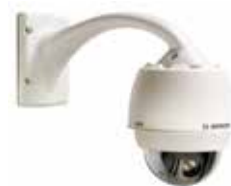
AUTODOME IP 7000.