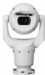
MIC IP 7000