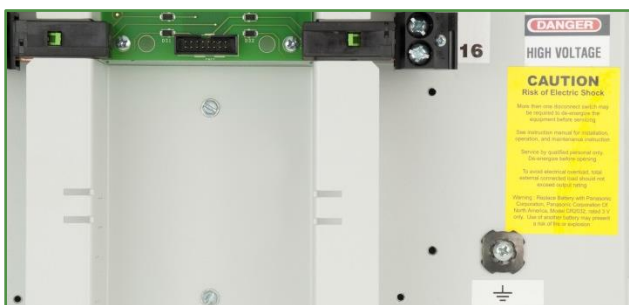
3. Remove transformer and pass-through terminal.