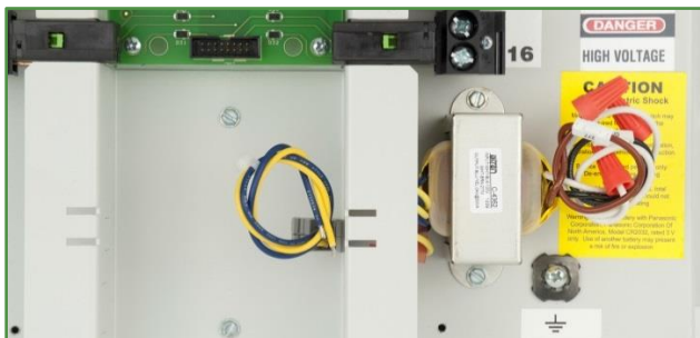
2. Disconnect transformer secondary leads from Controller Board (CB). Remove or reposition Controller Mounting Plate (CMP) assembly. Disconnect transformer primary leads (common and power).