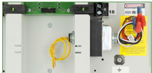
4. Remove round knockout. Install new transformer* in round knockout with the mounting feet facing upward.