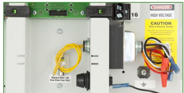
4. Install new transformer* in round knockout with the mounting feet facing upward.