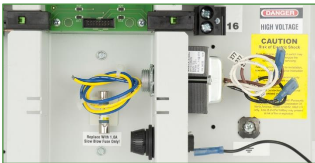
2. Disconnect transformer secondary leads from Controller. Remove or reposition Controller Mounting Plate (CMP) assembly. Disconnect transformer primary leads (common and power from fuse).