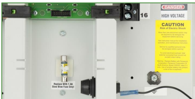
3. Remove transformer.