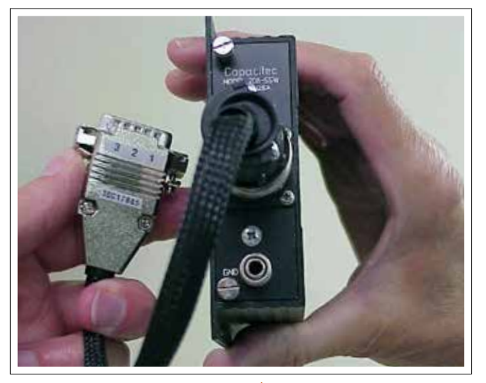
3 sensor input view with TRW/Souriau connectors