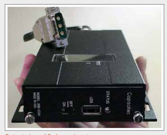
Output view of 3 channel system