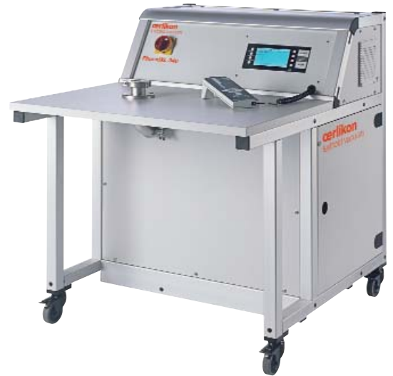
Customised PHOENIXL 340 for parts testing in series production