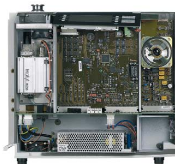
Internal design - clear and maintenance-friendly