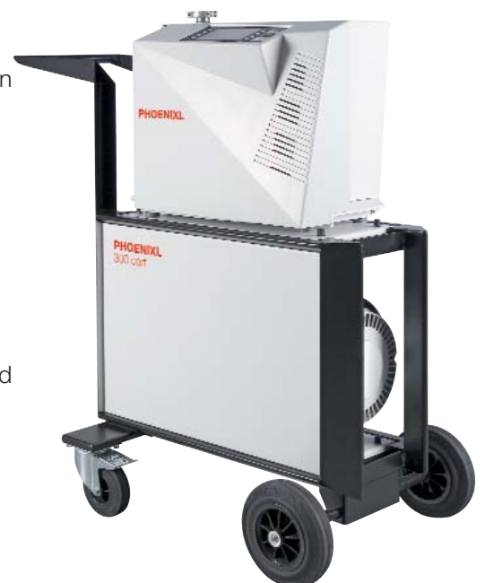
Cart 300 for PHOENIXL300