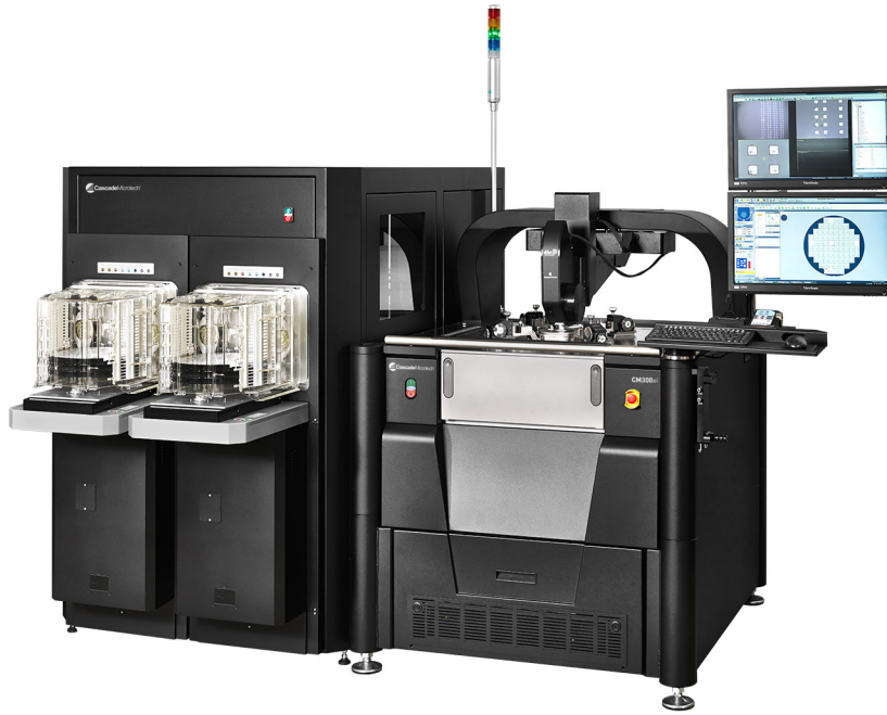
CM300xi fully-automated system with material handling unit (MHU), showing dual load port configuration.