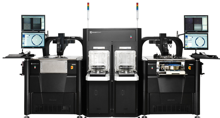
CM300xi fully-automated system with material handling unit (MHU), showing dual-prober configuration.