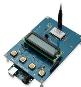
Test board TB-STD601

For some tests, we also used the TB-STD302 test board with a conversion board allowing the STD-601 to be pin compatible with our STD-302. The details of the TB-STD601 and the TB-STD302 are on our web site.