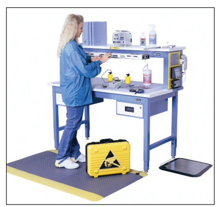
Figure 4: ESD workstation

grounding system is dependent upon the electrical outlets being wired properly. This can be easily checked with an AC outlet analyzer. A typical company would verify their electrical receptacles quarterly.