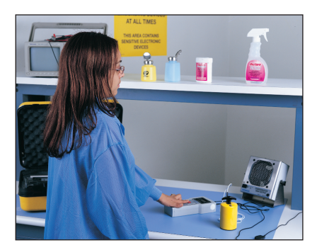
Figure 6: ESD mat with test kit

Most companies will have workers test their wrist straps while being worn daily. Per ESD-S1.1, paragraph 6.1.3, Frequency of Functional Testing, "the wrist strap system should be tested daily to ensure proper electrical value." However, two important wrist strap test