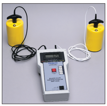
Figure 5: Surface resistance meter

The ESD Association standards, primarily used for test lab qualification testing, details RTT and RTG tests where the RTG test is to the mat's groundable snap. Steve Halperin of Stephen Halperin & Associates advises using a three-wire extension cord and measuring RTG to equipment ground. The electrical outlet and the extension cord should be checked to ensure that they are properly wired. Using a surface resistance megohmmeter with one 5# electrode, the sensing lead can be plugged into the extension cord (equipment ground), and then one can move the 5# electrode on many surfaces and quickly take many measurements. We refer to this test as using modified test methods in accordance with concepts outlined in ESD S4.1.