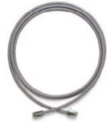
G10FP patch cord