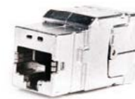
SYSTIMAX GigaSPEED X10D shielded high-density information outlet

The SYSTIMAX GigaSPEED X10D shielded high-density information outlet is the latest result of many years of continuous product development at CommScope Labs and features a patent pending flexible mounting system that enables a single connector to mount in three separate openings (high density, M-Series, and keystone). The HGS620 has a rugged, full-metal construction and allows for multiple size cable terminations for F/UTP and S/FTP installation (0.270 inches up to .300 inches [6.9 mm to 7.6 mm] diameter over jacket).