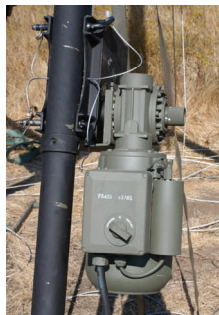
Electrical motor for lifting winch