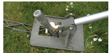
Stake remover for hard soils