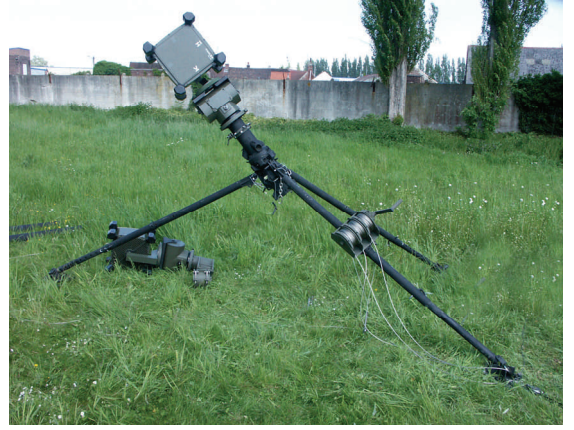
Kneeling position enables easy access to the top load

One person is in charge of the lifting winch, and the other person the guy winch. The guy winch keeps the top guys under tension during deployment allowing the mast to be deployed in high winds. The mast tubes are fed into the tripod from the underside, and then lifted into position using the supplied by the lifting winch mechanism. Once fully erected the mast guys can be fully tensioned.