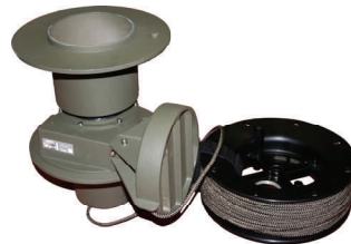
Electrical or manual positioner