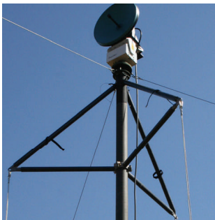
Anti-twist systems: Star Bar and T-Bar