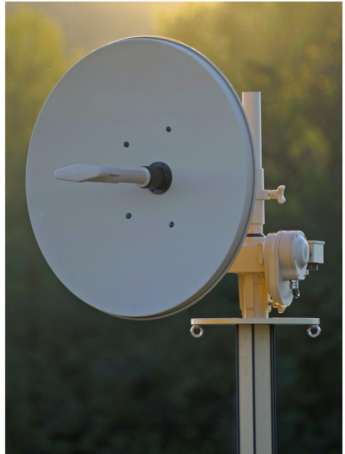
CAPAS -SR rotator with Comrod band IV antenna mounted on a Comrod TM210 electro-mechanical mast

CAPAS-SR is fully rugged per MIL-STD-810, and is suitable for a wide variety of tactical masts.