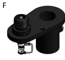
F Mast Mount Bracket 40mm Socket 50mm Socket Customer Specified