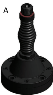
A NATO 4-hole Spring 4 x M10 or 3/8" Bolts on 114mm PCD Base diameter 140mm Base height 215mm

Bases are available to suit most installations including vehicle, mast and shelter mounting. Many are available with optional L1 & L1/L2 GPS. All bases are supplied with a protective top cap. See below for mounting options:-