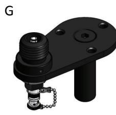
G Mast Mount Bracket 24mm Spigot 40mm Spigot 50mm Spigot Customer Specified