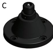
C NATO 4-hole Rigid 4 x M10 or 3/8" Bolts on 114mm PCD Base diameter 140mm Base height 100mm