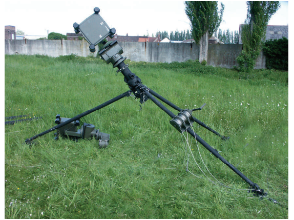
Kneeling position enables easy access to the top load

One person is in charge of the lifting winch, and the other person the guy winch. The guy winch keeps the top guys under tension during deployment allowing the mast to be deployed in high winds. The mast tubes are fed into the tripod from the underside, and then lifted into position using the supplied by the lifting winch mechanism. Once fully erected the mast guys can be fully tensioned.