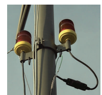
Night warning beacon