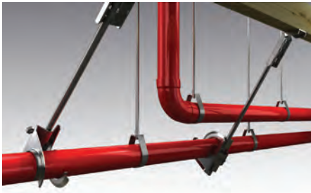
Branch line restraint