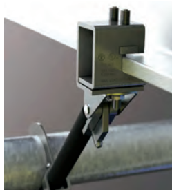
Universal structural attachment