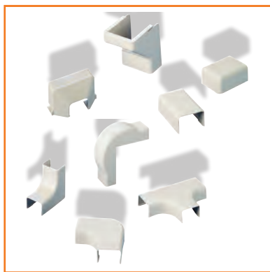
Surface Raceway Accessories