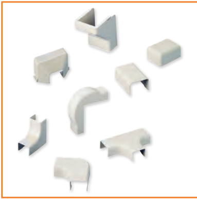
Surface Raceway Accessories