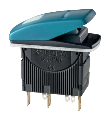
E-T-A circuit breaker type 3131