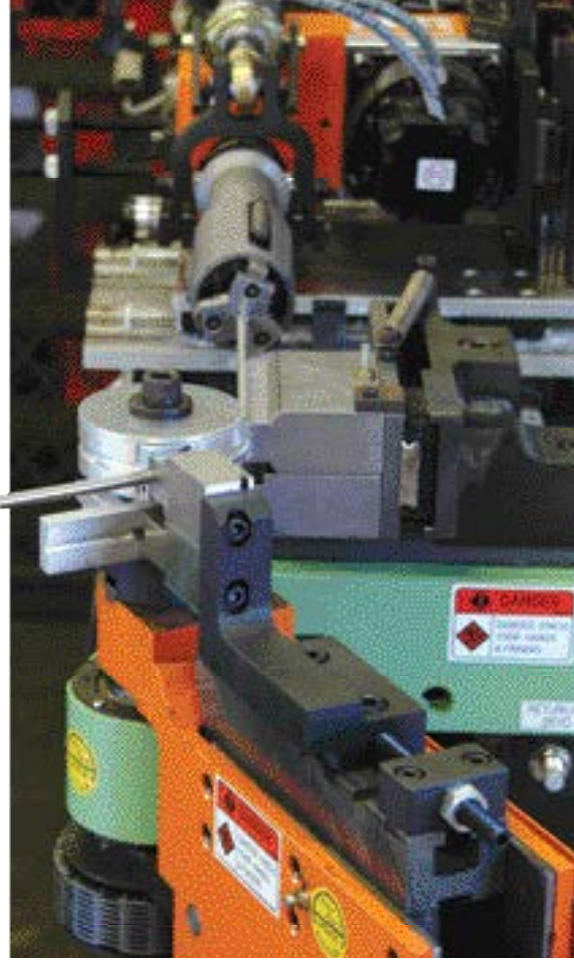
Shown above is one of the new, high precision, bending machines currently in operation at Eagle.