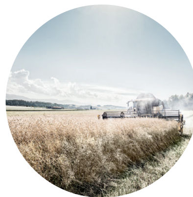
Heavy Duty & Special Vehicles

Virtually no other market combines technology, design, and safety to such a high standard as the automotive industry. Such complexity provides the sort of challenge we relish. Innovative and reliable technology paired with customer-specific functionality are what characterize our sensor-controlled, electronic, and electromechanical control elements. As a globally certified partner to major automotive manufacturers and suppliers, we impress our customers with the excellent quality of our products and services.