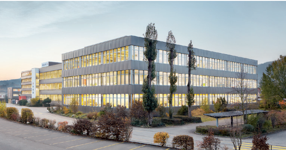
EAO Headquarters Olten, Switzerland

We act responsibly. In our ecological focus, we set benchmarks for ourselves, our products, and our customers. Our purchasing, manufacturing, and logistics operations are carried out in a manner that conserves resources and which is environmentally friendly. When selecting our components and materials, we ensure that we have partnerships in place with certified manufacturers and that we adhere to EC guidelines on hazardous materials (RoHS). We view continuous monitoring and optimization procedures at all levels as a vital part of our commitment to protecting the environment.