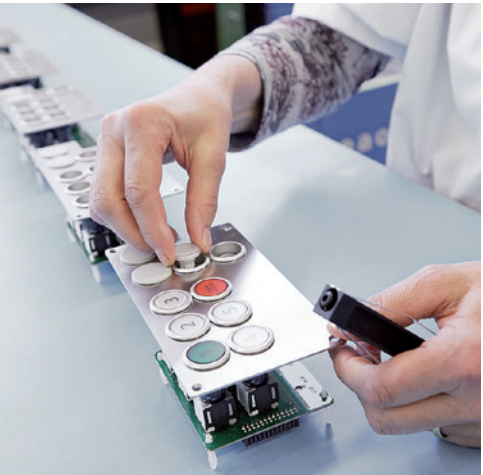
Leading-edge technology by Swiss craftsmanship