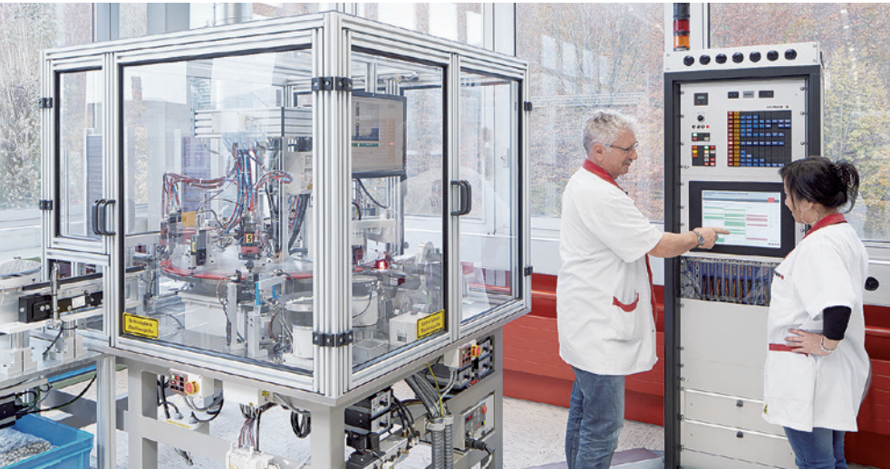
Fully automated assembly with a human touch

The individual adaptability of our components means that small as well as more major customizations can be carried out directly by EAO. We can also offer customized innovations based on standard components, with subsequent serial production. Meeting the requirements of our customers and the needs of end-users is what we do best.