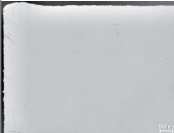
Testpiece (x20 magnification)