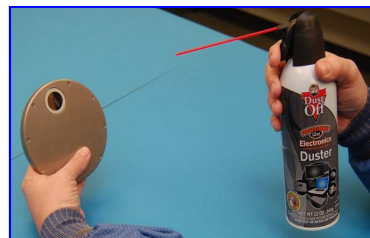
Left to Right