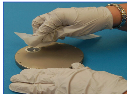
Left to Right