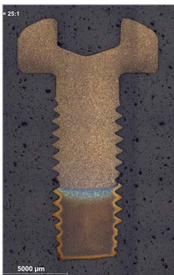
Hardness zones of a duoHARDtip® Spiralform