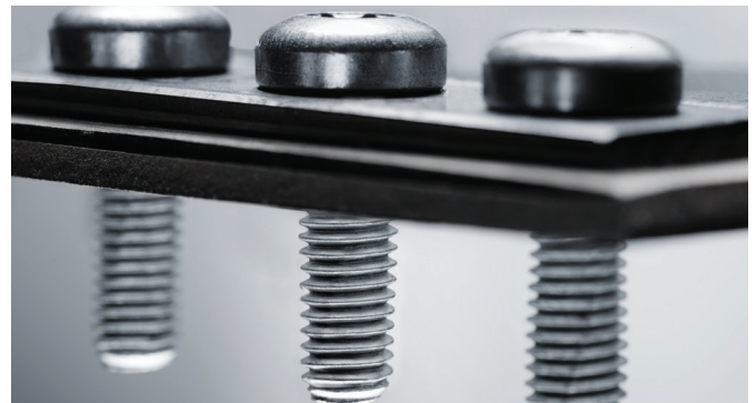
Spiralform® M5x16 duoHARDtip after directly fastened into 1.6 mm MSW 1200