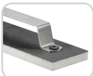
Rohacell foam + CRP top layer Pull-out force 1,300-1,700 N