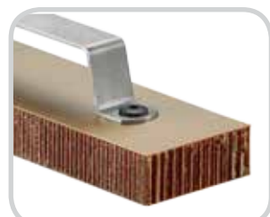
Aramid honeycomb + Aramid fibre top layer Pull-out force 700–1,200 N