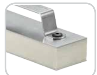
PUR foam + 0.6mm Aluminium AW3003 Pull-out force 800 N