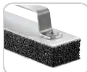
EPP foam + PP GF top layer Pull-out force 500-900 N