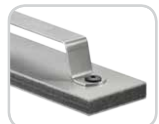
PP GF Foam + PP GF top layer Pull-out force 1,900 N

For more information please contact Tony Wiegandt, phone +49 36252 42-361, e-mail twiegandt@ejot.de