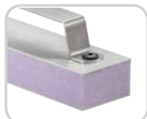
XPS- foam + PS GF top layer Pull-out force 500 N