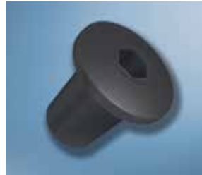
EJOT TSSD® – as direct fastening element

During the joining process, a thermoplastic boss is installed into the plastic component with a defined rotation speed and axial load. The installation can be done with or without a pilot hole, depending on the component material. Due to the applied axial load the fastening element penetrates the component and the frictional heat caused by the rotation causes a partial fusing of the joining parts. After a brief cooling time a thermal and / or mechanical adhesive bond and form-fit occurs, depending on the material.