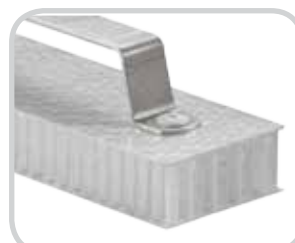
PP honeycomb + PP GF top layer Pull-out force 800 N