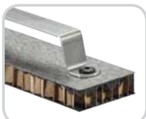
Paper honeycomb + PUR GF top layer Pull-out force 900 N