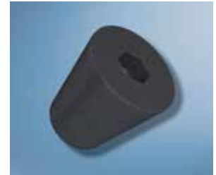
EJOT TSSD® – as screw boss for the DELTA PT® screw