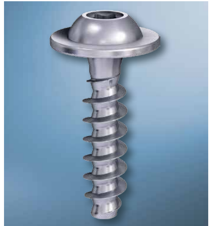
The EJOT PT® screw with 30° flank angle and recessed thread root.

For materials with high filler content or high internal strength, the use of EJOT DELTA PT® is recommended.