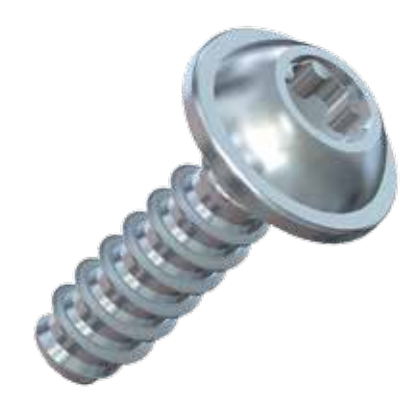
EJOT DELTA PT® for selftapping in thermoplastic materials