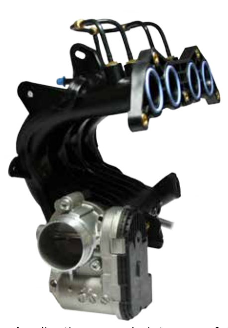
Application sample into manyfold

For higher filled materials or materials with a bigger strength the hole diameter can be increased up to d_b = 0.88 \times d_1 .