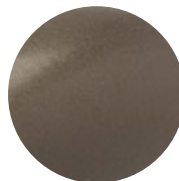
Oil rubbed bronze

The Life Line Collection is a unique selection of products that will make your bathroom a much safer environment. Combined with simple installation, this makes our Life Line Collection the #1 choice for designers & remodelers.