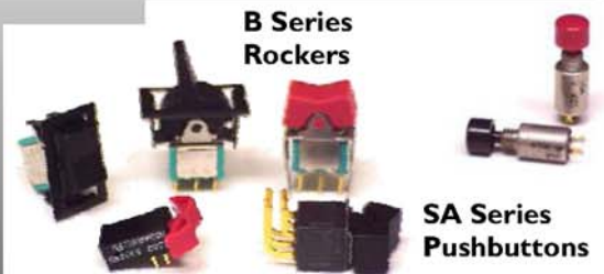
B Series Rockers

Electroswitch Miniature Switches are rated up to 6 amps with up to 4 poles and numerous terminal & actuator options. Sealing options include an IP67 rating.