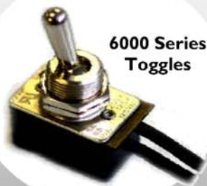
6000 Series Toggles

The 6000, 7000 and 9000 Series power toggles have up to a 20 amp rating in a compact size. These switches are available in a wide range of momentary and maintained single throw or double throw circuits, multiple termination, and bushing/toggle configurations.