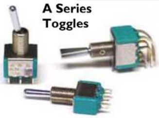
A Series Toggles

The 6000 and 7000 Series power pushbutton switches are rated up to 15 amps. These are heavy duty switches suitable for a variety of foot switch applications.