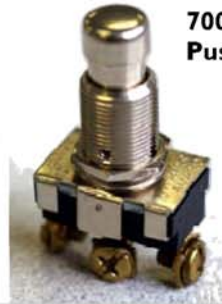
7000 Series Pushbuttons

The 6000 and 7000 Series power pushbutton switches are rated up to 15 amps. These are heavy duty switches suitable for a variety of foot switch applications.