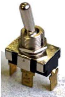
7000 Series Toggles

The 6000, 7000 and 9000 Series power toggles have up to a 20 amp rating in a compact size. These switches are available in a wide range of momentary and maintained single throw or double throw circuits, multiple termination, and bushing/toggle configurations.