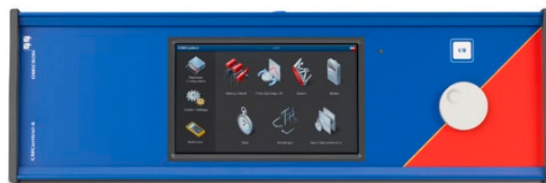
CMControl-6 Front Panel Control (option)

Besides its operation with the powerful Test Universe software running on a PC, the CMC 356 can also manually be controlled with the highly flexible CMControl unit .