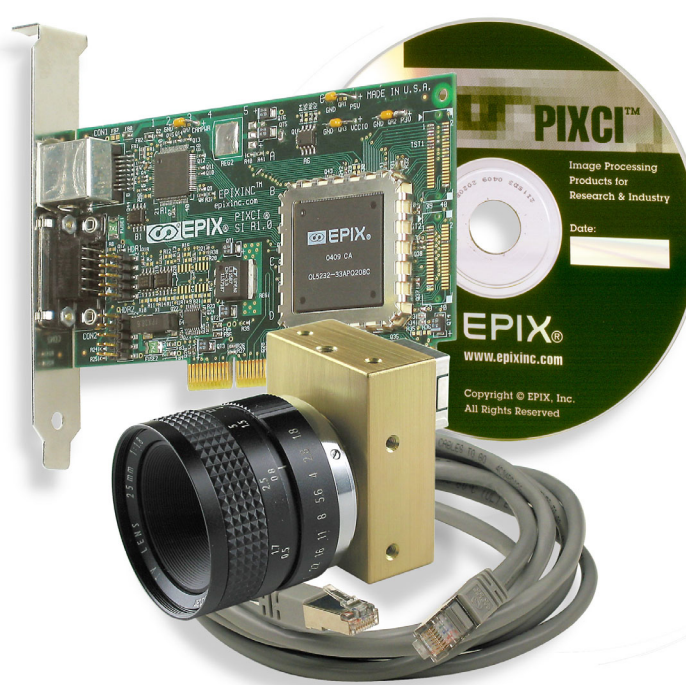
(Lens not included)