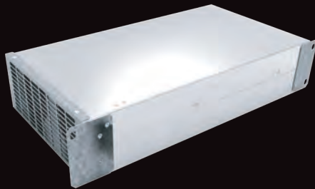
Charge module: 15KW