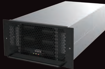
Charge module: 30KW