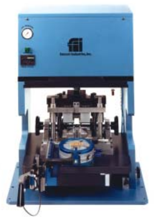
This pneumatic press enables operators to adjust all the key dimensions for lead forming, including tip-to-tip length, foot length, offset height, and bend radii.

igh-reliability, fine-pitch microelectronic packages for military and aerospace applications typically cost $2,000 to $4,000 each. Some components cost as much as $50,000.