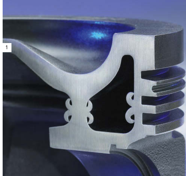
1. Federal-Mogul Monosteel diesel pistons are manufactured by friction-welding the crown to the skirt, creating a large volume cooling gallery between the ring pack and the combustion bowl

Capricorn's Howell-Smith fully agrees with Baberg's outlook: "A notable addition is multiscale testing to