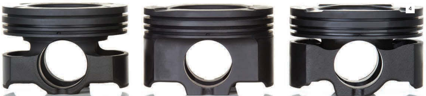
4. Mahle steel pistons for passenger car applications. The company recently announced that Renault's 1.5-liter and 1.6-liter four-cylinder diesel engines would be using Monotherm steel pistons