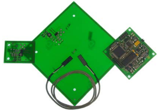
As external antennas, two 50Ω antennas ID ISC.ANT40/30 and ID ISC.ANT100/100 are available.